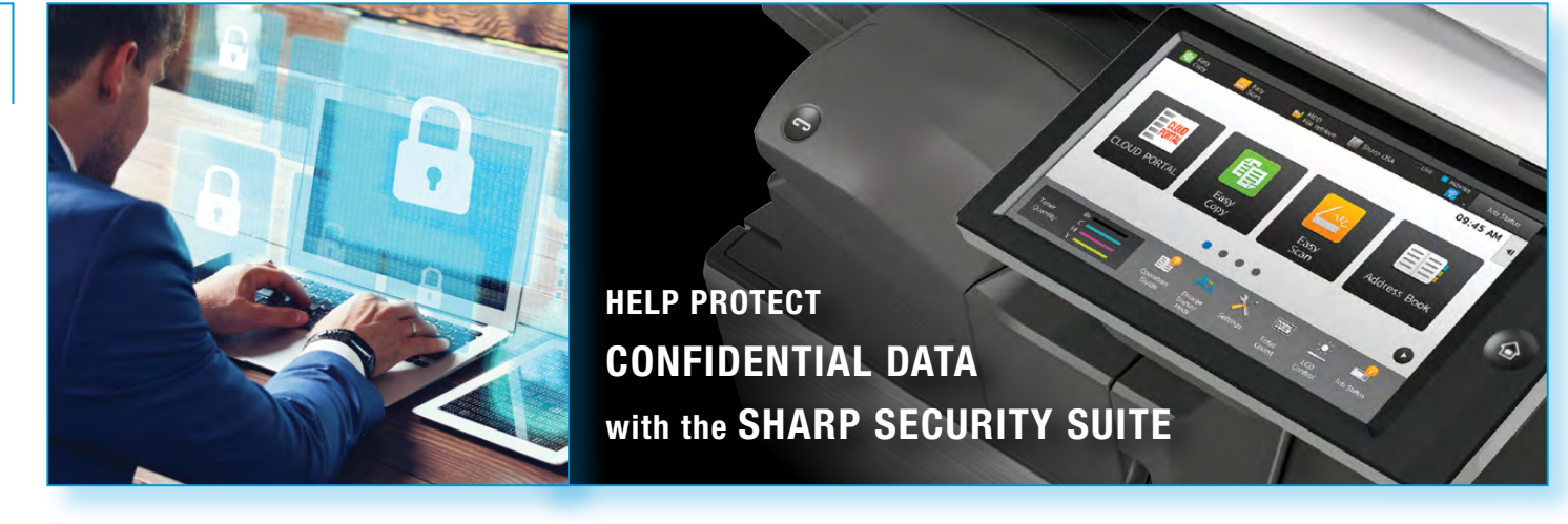
Hassle-free erase/overwrite of data and settings completed securely.

Up to 10 times programmable overwrite is used to maximize the data erase efficiency. The data is overwritten by random numbers. In addition, the data overwrite method can be customized to meet each organization's security requirements or it can be set as it is specified in DoD 5220.22-M.